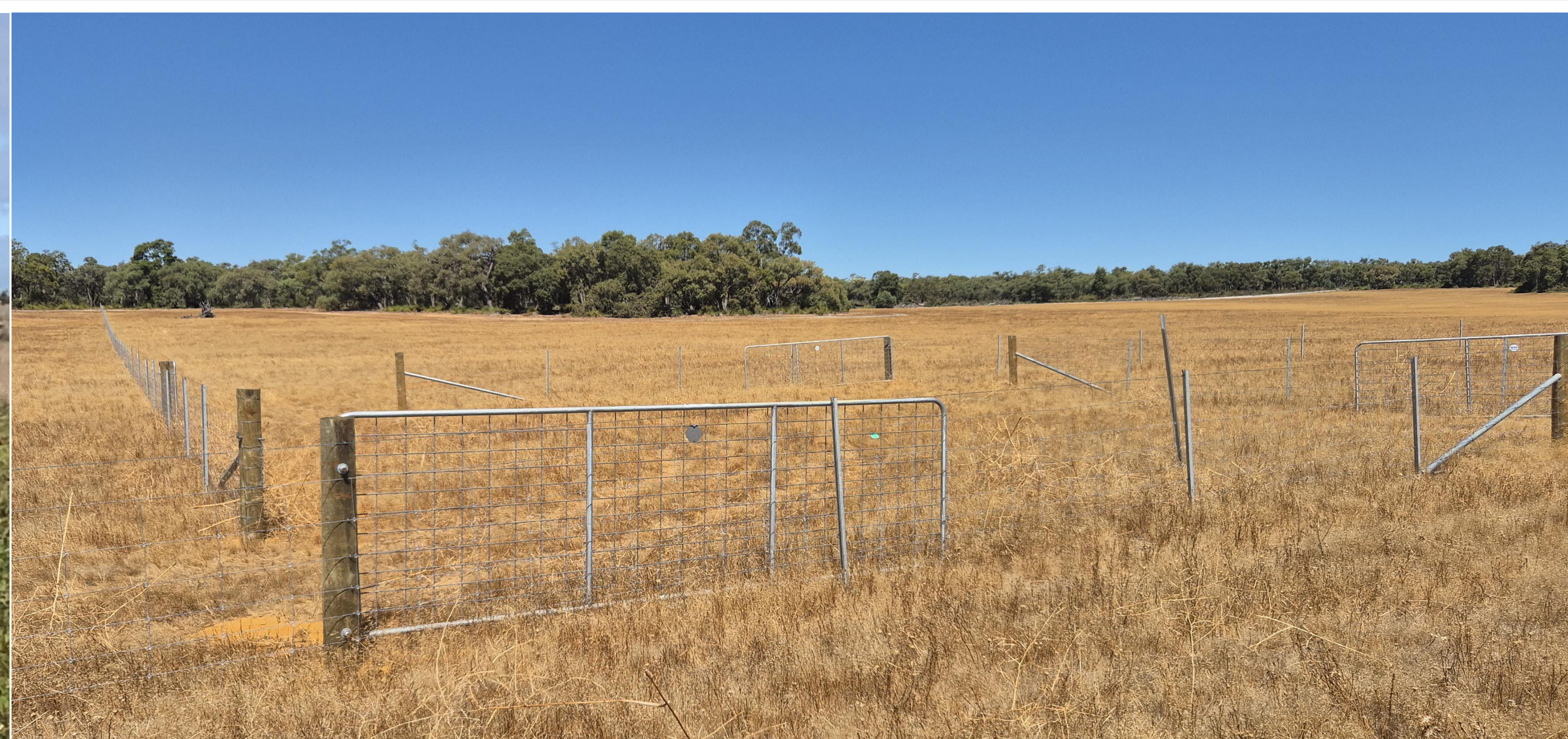
Above (L-R): Project sites