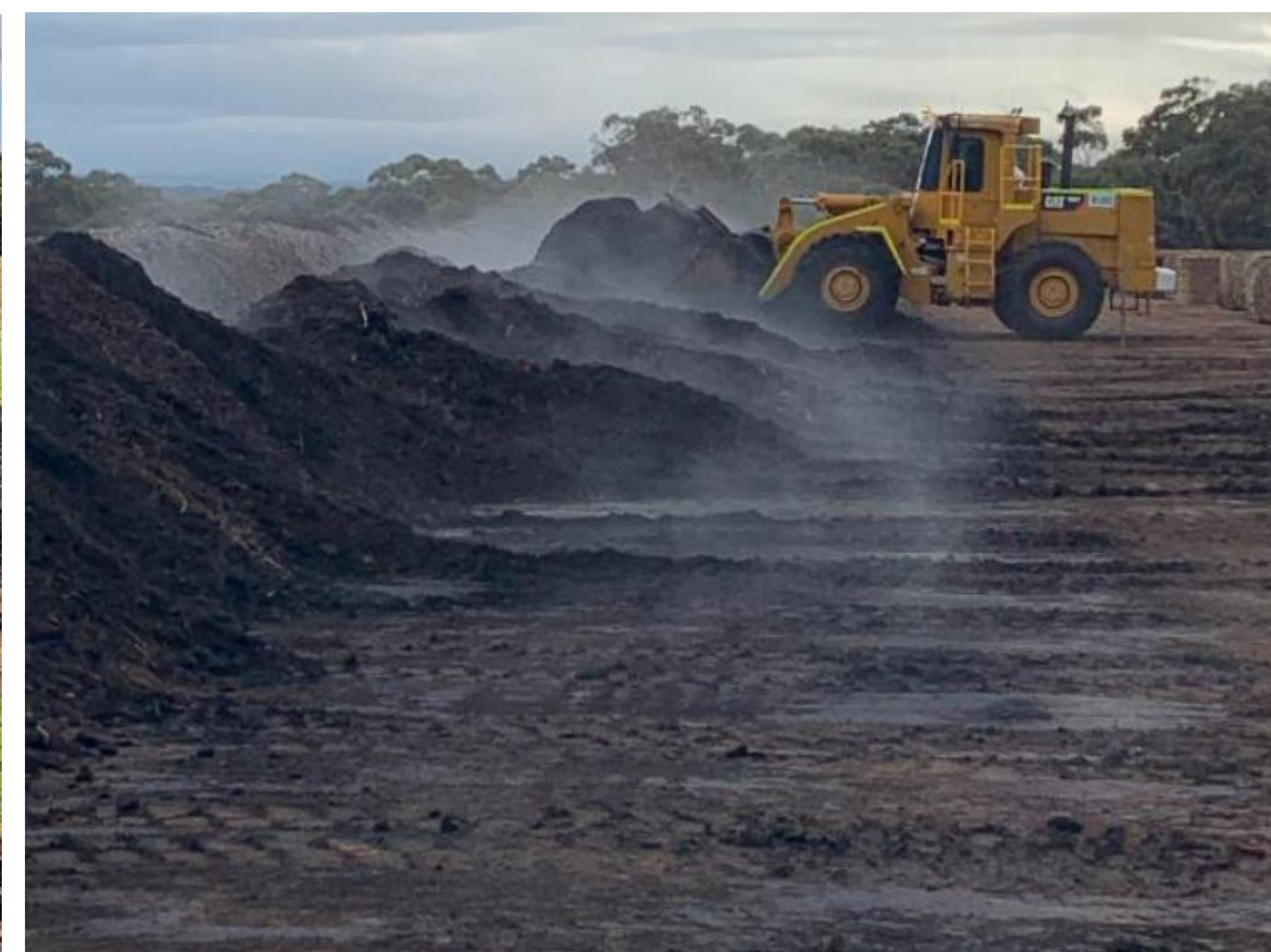
Above: Compost being prepared for distribution across Undanooka Farm, 2022..