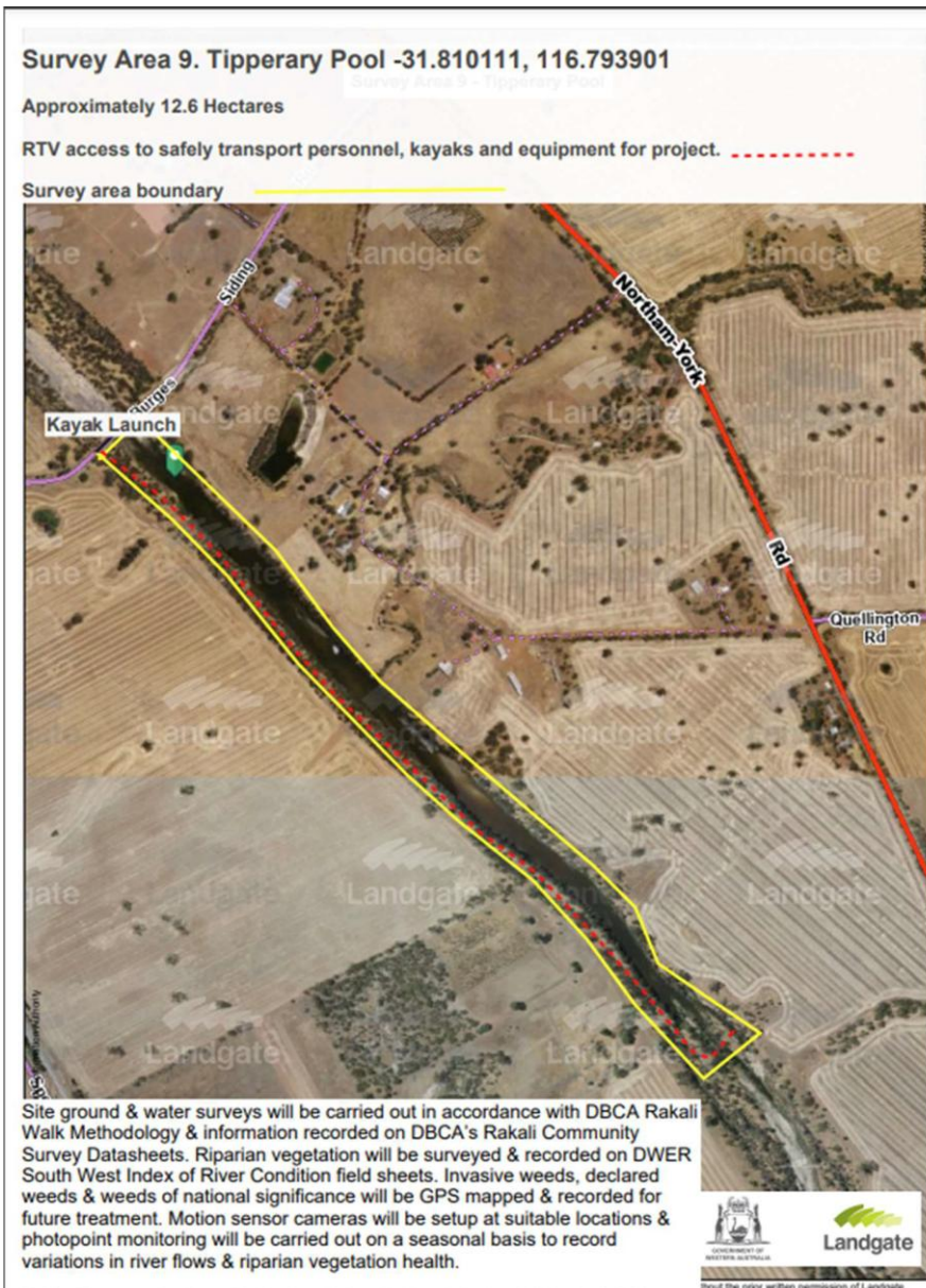
Site map with area outlined and detail of the works to be undertaken.